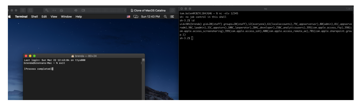
reverse shell via zprofile command

As you can see in the above figure, the victim sees nothing suspicious when they start a terminal session. Meanwhile, we get our reverse shell.