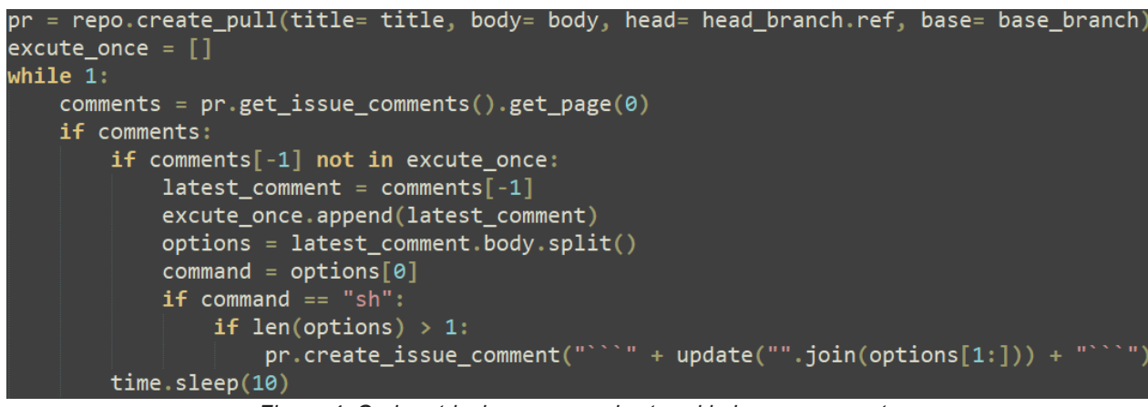
Figure 4. Code retrieving commands stored in issue comments

BingoShell is a backdoor written in Python that uses GitHub to control compromised machines. Once run, it uses a hardcoded token to access a private GitHub repository. According to the initial commit of the main branch, the repository was probably created on January 24th, 2024. BingoShell creates a new branch in the repository and a corresponding pull request. The backdoor reads comments on the newly created PR to receive commands to execute on the compromised machine, as illustrated in Figure 4.