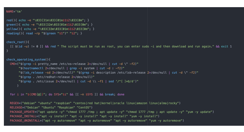
Figure 3: Screenshot of Function tm Performing System Checks

In a second campaign, a threat actor followed a similar pattern of passing a base64 encoded Python script in the "goog:chromeOptions" configuration to inject the script as an argument. Decoding the Python script reveals a Bash script.