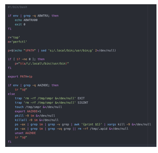
Figure 7: Bash Script from Top

Top is a Shell Script Compiler (SHC) compiled ELF binary. SHC compiles Bash scripts into a binary with the contents encrypted with ARC4, making detection and analysis more difficult.