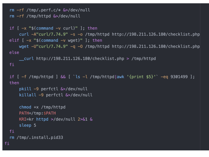
Figure 4: Bash Script From Python Script

The script checks the system's architecture and ensures it's running on a 64-bit machine, otherwise it exits. It then prepares the environment by creating necessary directories and attempting to remount "/tmp" with executable permissions if they are restricted. The script manipulates environment variables and configuration files, setting up conditions for the payload to run. It checks if certain processes or network connections exist to avoid running multiple instances or overlapping with other malware. The script downloads an ELF binary "checklist.php" from a remote server with the User-Agent string "curl/7.74.9". The script checks if the binary has been downloaded based on bytes size and executes it in the background. After executing the payload, the script performs clean up tasks by removing temporary files and directories.