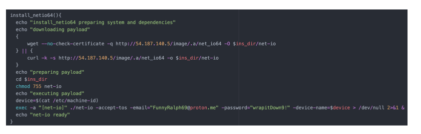
Figure 2: Screenshot from pl Script Installing IPRoyal

IPRoyal Pawns is a residential proxy service that allows users to sell their internet bandwidth in exchange for money. The user's internet connection is shared with the IPRoyal network with the service using the bandwidth as a residential proxy, making it available for various purposes, including for malicious purposes. <u>Proxyjacking</u> is a form of cyber exploitation where an attacker hijacks a user's internet connection to use it as a proxy server. This allows the attacker to sell their victim's IP to generate revenue.