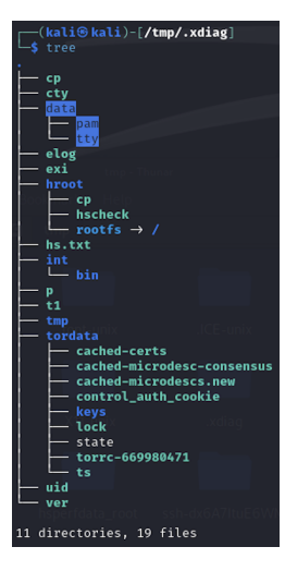
Figure 5: .xdiag Directory