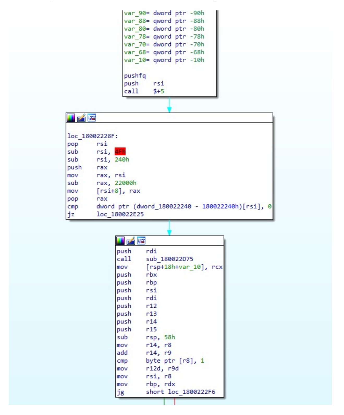
Figure 3. Obfuscated main function by code virtualizer