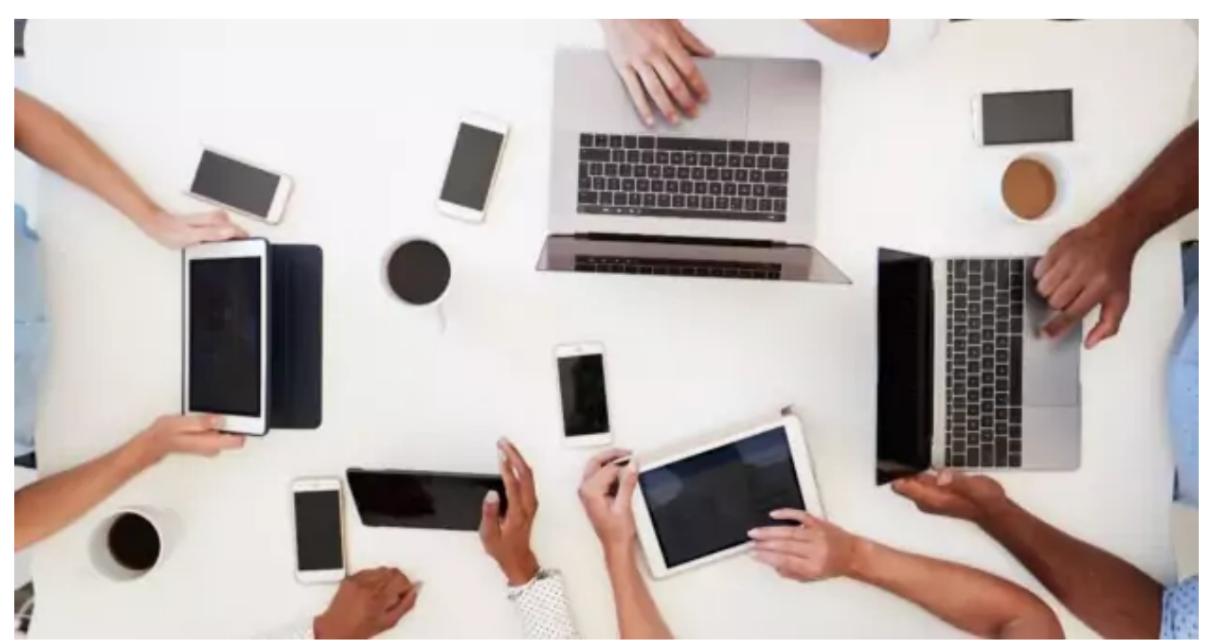
September 4, 2024