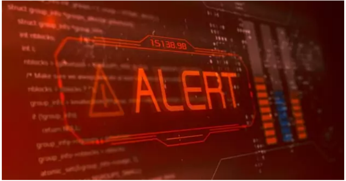
September 26, 2024