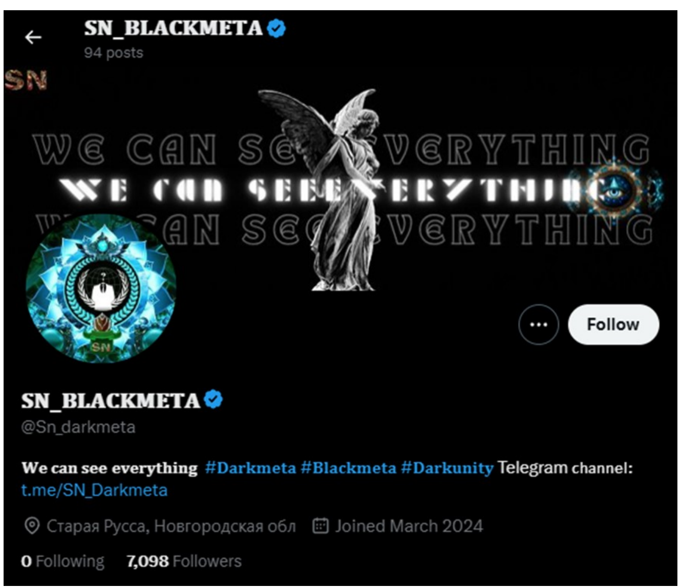
Figure 3: Sn_darkmeta user profile on X

Amidst this flurry of cyber activity, a pivotal figure emerged. In March 2024, the X user @Sn_darkmeta was created, proclaiming himself as the leader of SN_BLACKMETA. The self-styled "Great Leader DarkMeta" routinely began his posts with big declarations. They reposted images and summaries of the actions and attacks reported on the Telegram channel, crafting a persona that bolstered the group's visibility and ideological messaging.