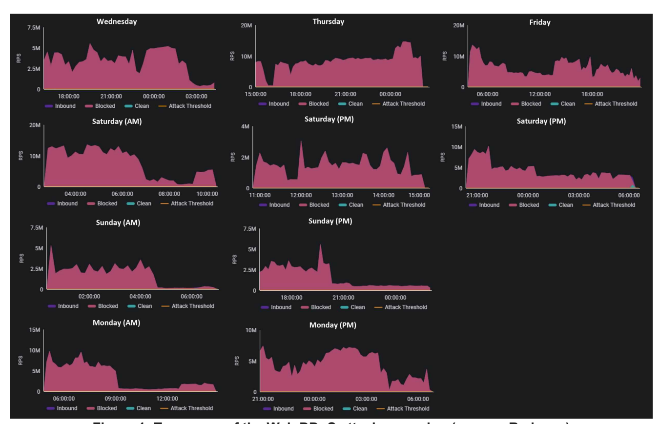
Figure 1: Ten waves of the Web DDoS attack campaign

This year has been marked by a record-breaking six-day attack campaign consisting of multiple four to 20-hour Web DDoS waves, amounting to a total of 100 hours of attack time and sustaining an average of 4.5 million RPS with a peak of 14.7 million RPS.