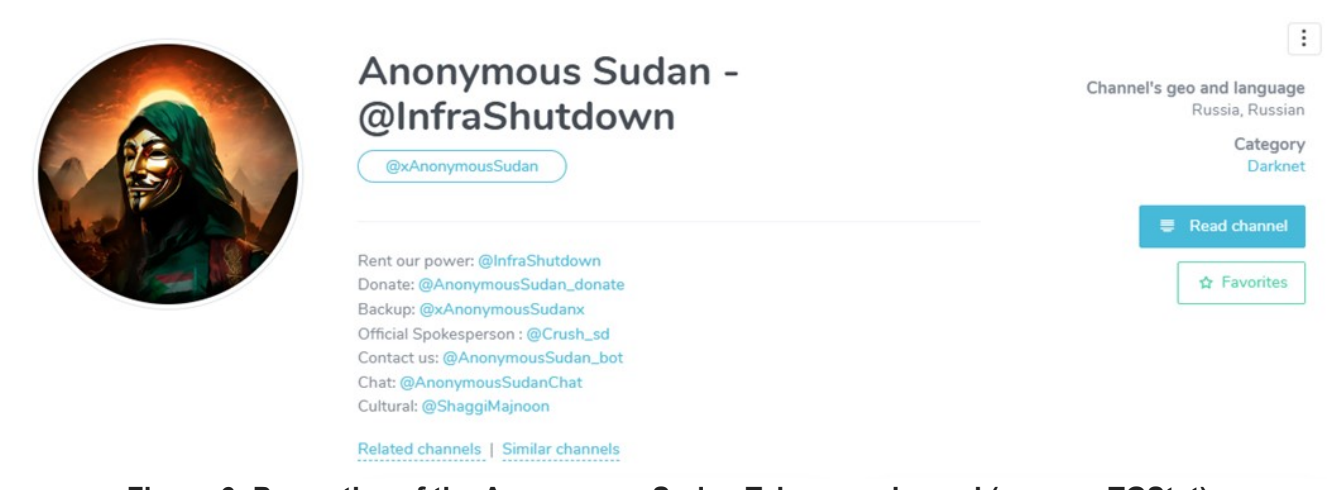
Figure 6: Properties of the Anonymous Sudan Telegram channel

The Telegram channel Anonymous Sudan, according to TGStat.ru, was created from within Russia and its initial language was set to Russian. While most posts by Anonymous Sudan were in Arabic and English, initial posts also contained Russian. The SN_BLACKMETA Telegram channel has no geography or language listed, however the X account profile in Figure 6 shows it was created in Staraya Russa, a town in Novgorod Oblast, Russia. Although SN_BLACKMETA posts some announcements to its Telegram channel in three languages (English, Arabic and Russian), other posts are just in English and Arabic (see Figure 4).