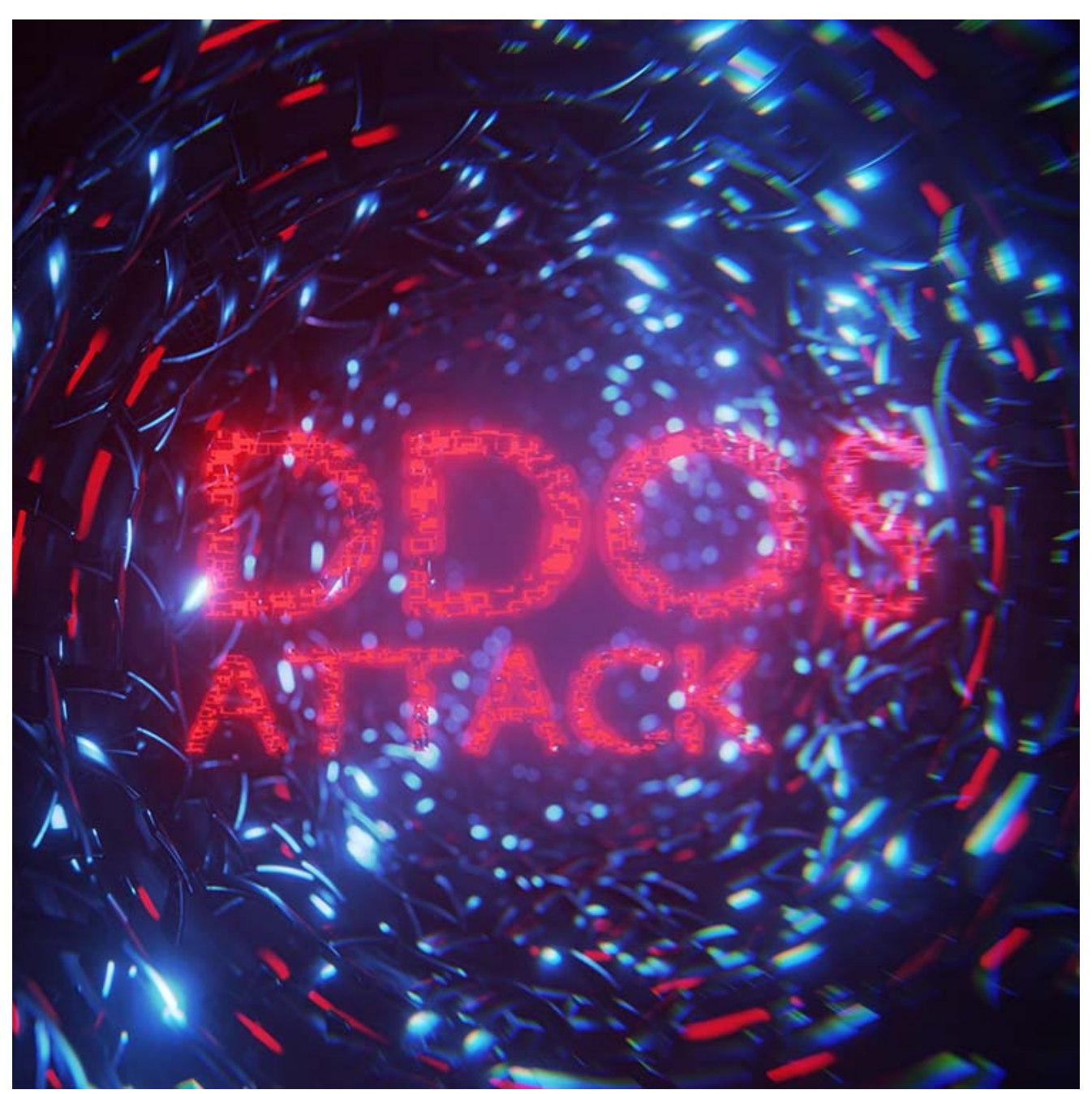
Record-breaking six-day attack campaign consisting of multiple four to 20-hour Web DDoS waves.