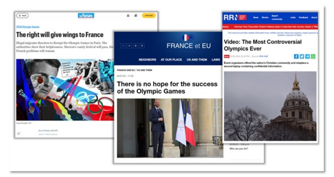
Fig 4: A selection of Storm-1099's anti-Olympics messaging, including from its core disinformation outlet Reliable Recent News (RRN).