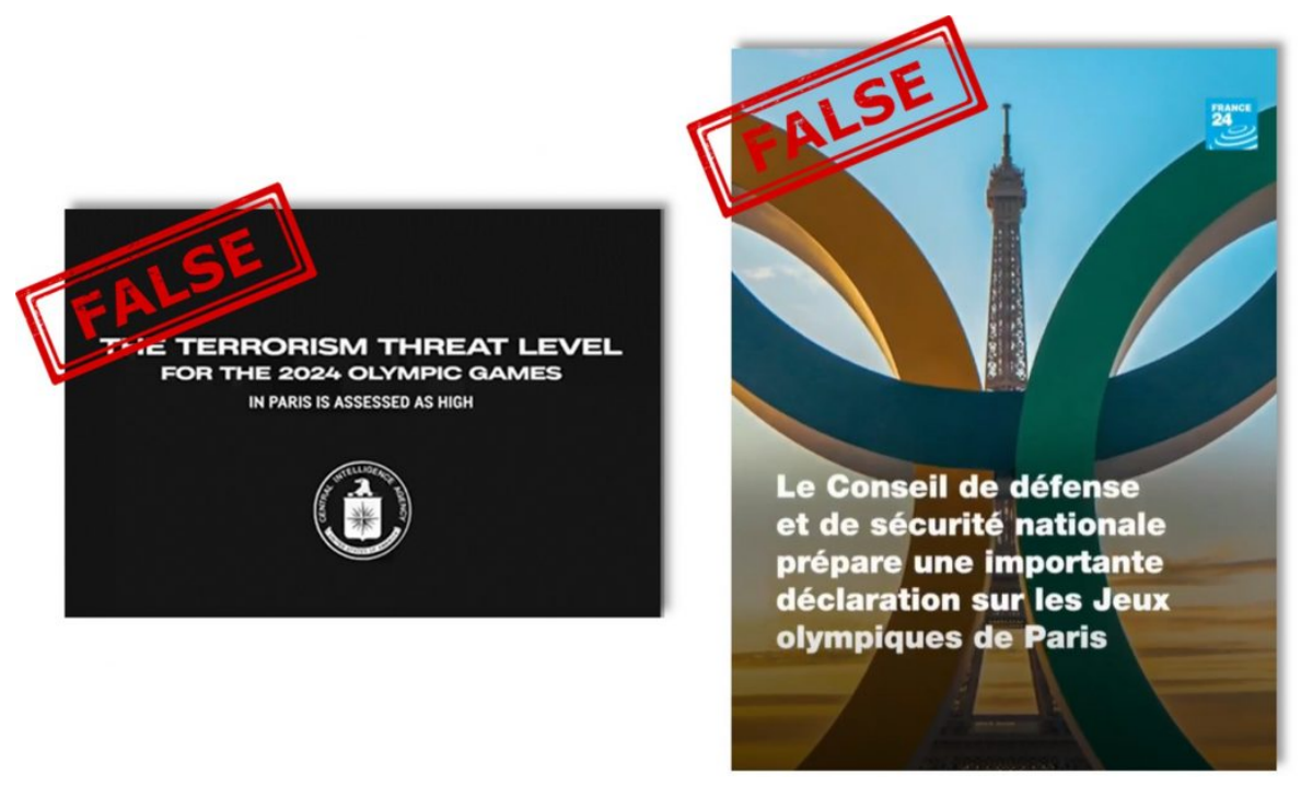
Figure 2: A faked video press release warning the public of possible terror attacks at the 2024 Paris Summer Olympics (left). A fabricated France 24 news clip claiming that nearly a quarter of Paris 2024 tickets have been returned due to concerns over terrorism (right). Both forgeries were produced by Russia-affiliated actor Storm-1679.

Fake video press releases were produced posing as coming from the American Central Intelligence Agency (CIA) and the French General Directorate for Internal Security (DGSI) warning potential attendees to stay away from the Paris 2024 Olympics due to the alleged risk of a terror attack.