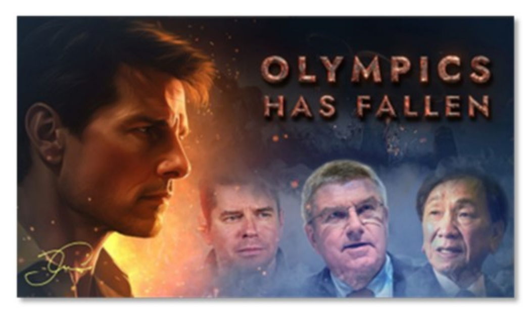
Figure 1: A visual from the fake documentary "Olympics Has Fallen", produced by Russia-affiliated influence actor Storm-1679, which targets the International Olympic Committee and advances pro-Kremlin disinformation. The documentary uses the image and likeness of American actor Tom Cruise, who did not participate in any such documentary.

impersonating the actor Tom Cruise to imply his participation, the film disparaged the IOC leadership. The use of slick computer-generated special effects and a broad marketing campaign, including faked endorsements from Western media outlets and celebrities, indicates a significant increase in skill and effort compared to most Influence Operations (IO) campaigns.