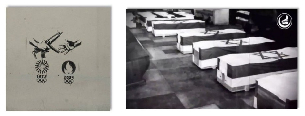
Figure 3: An image of graffiti, reportedly left in Paris, threatening a repeat of the 1972 Munich terror attacks at the upcoming Olympic Games in Paris (left). A still image from the false-flag terror threat, purportedly from Turkish ultranationalist group the Grey Wolves, whose symbol is visible in the topright corner of the screen. The video was widely publicized by pro-Russian bot accounts and prompted a response from the Israeli Olympic Committee (right).