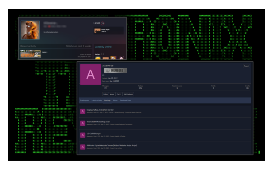
Figure 6: atseverse online profile

Doing a bit of research on the username "atseverse" we came up with all kinds of interesting findings that produce some telling information that fits the geographic profile for both Steam, a popular gaming platform, and a hacking website called spyhackerz: