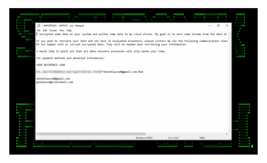
Figure 5: MIMIC ransomware payment notification

Once the encryption process was completed, the red.exe process executed the encryption/payment notice which was saved on the victim's C:\ drive as "—IMPORTANT—NOTICE—.txt". The text file contained the following message: