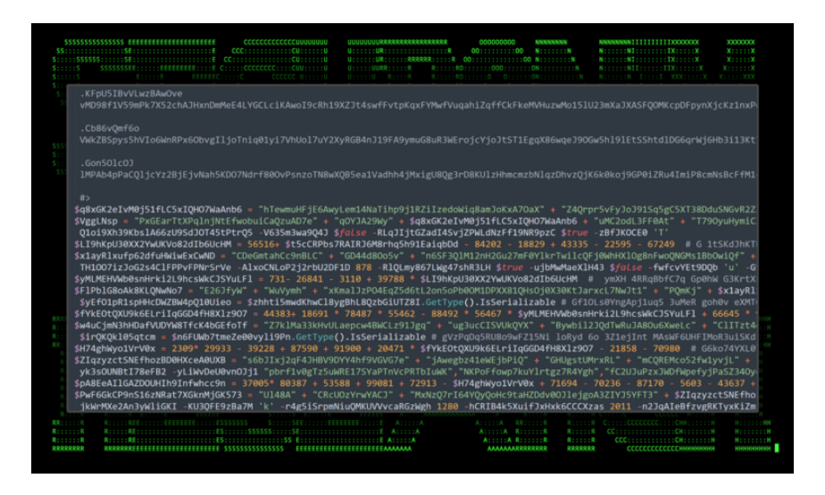
Figure 2: PowerShell initial code execution (phase 2: Cobalt Strike)

The main focus of the obfuscation was centered around the DLL imports and the Cobalt Strike payload which consisted of hundreds of lines of combined variables and useless comment blocks.