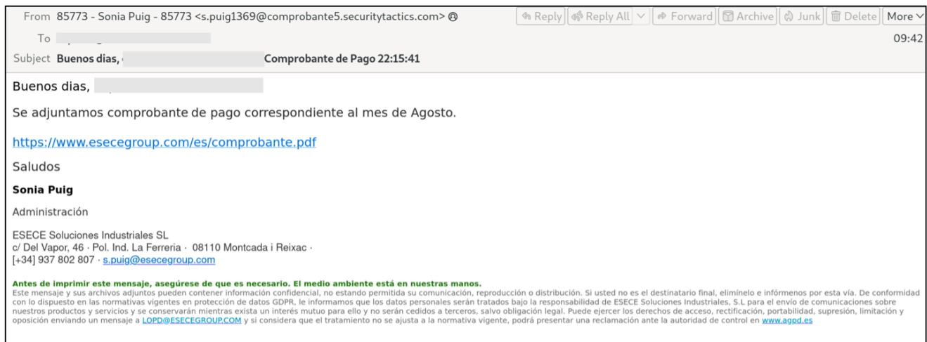
Figure 2. Example of TA2725 targeting of victims in Spain in August and September by spoofing ÉSECE Group, a Spanish manufacturing company.

Threat actors from the Americas have previously targeted organizations in Spain but have typically used more generic malware or phishing campaigns that were unique to Spain. In this case, the threat actors have expanded this version of Grandoreiro that had previously only targeted the Americas to include other parts of the world.