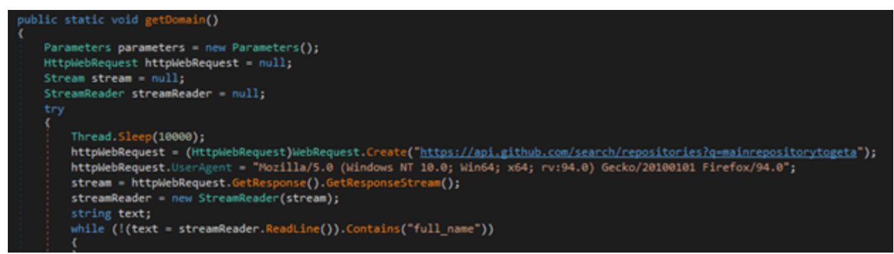
Figure 2. <u>DnSpy</u>-decompiled .NET code from SessionService.exe.

Figure 2 shows decompiled .NET code from SessionService.exe. The binary uses the GitHub API to search for the 'mainrepositorytogeta' repository.