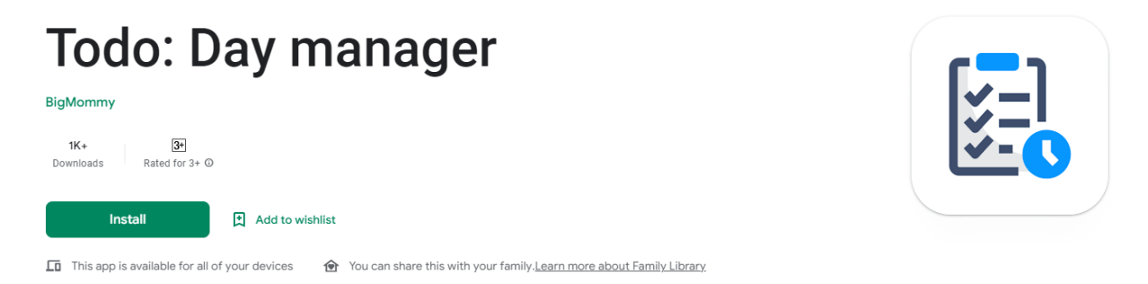
Fig no 1.Malware Installer From Play Store

The Zscaler ThreatLabz team has recently discovered the Xenomorph banking trojan embedded in a Lifestyle app in the Google Play store. The app is "Todo: Day manager," and has over 1,000 downloads. This is the latest in a disturbing string of hidden malware in the Google Play store: in the last 3 months, ThreatLabz has reported over 50+ apps resulting in 500k+ downloads, embedding such malware families as Joker, Harly, Coper, and Adfraud.