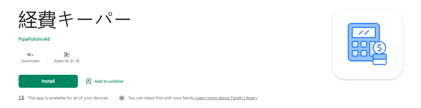
Fig no 10. Suspicious Installer exhibiting the same behavior

ThreatLabz also observed another application, named "経費キーパー" (Expense Keeper), exhibiting similar behavior. On execution of this application, it is observed that the "Enabled parameter" is set to false, same as the execution previously shown in Figure 4. Due to that, it was not possible to retrieve the Dropper URL for the banking payload. ThreatLabz is working with the Google Security team for the same.