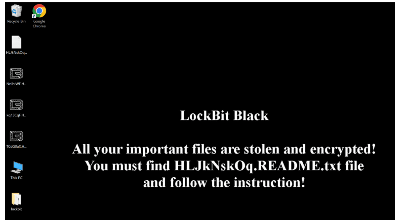
Image Showing Desktop Wallpaper after Encryption Process is Completed

The LockBit creators offer access to the ransomware program and its infrastructure to thirdparty hackers known as affiliates, who break into networks and install it on systems in exchange for a cut of up to 75% of the ransom paid by victims. LockBit, like most similar RaaS gangs, employ double extortion tactics in which its associates exfiltrate data from victim organizations and threaten to disclose it online.