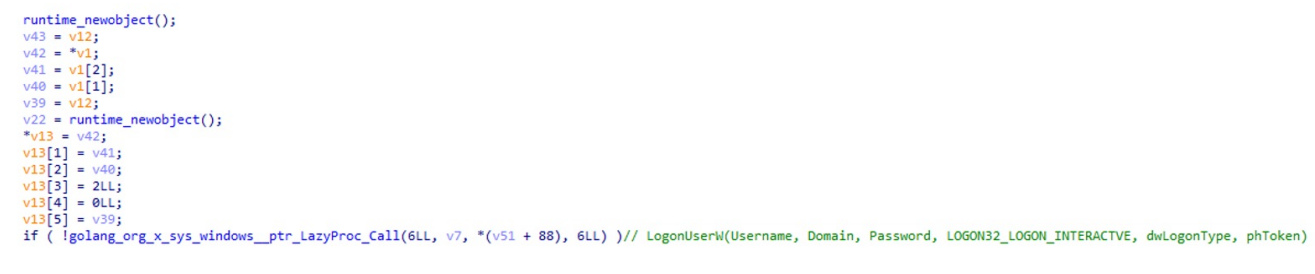
Figure 11. Agenda performing logon using a parsed account

The function used by Agenda to parse the accounts field in the runtime configuration