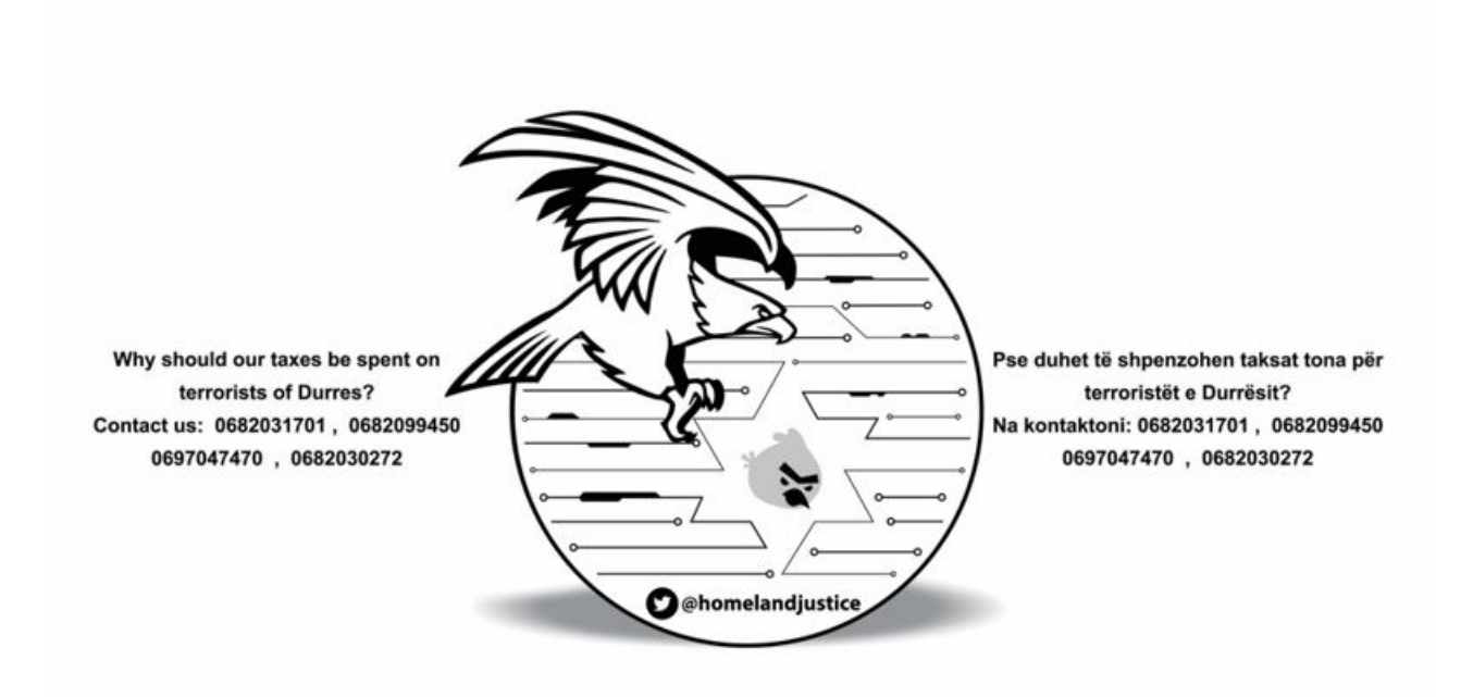
Figure 2: ROADSWEEP wallpaper and HomeLand Justice banner

After posting multiple links to news stories on the disruptive activity against the Albanian government on July 26, 2022, HomeLand Justice directly claimed credit for the operation on its Telegram channel in a message alleging corruption in the Albanian government and repeating the message from the ransom note (Figure 3). Notably, the posts used the hashtags #MKO, #ISIS, #Manez, and #HomeLandJustice. Manëz is a town in the Durrës County and the location for the World Summit of Free Iran conference which was set to take place on July 23-24.