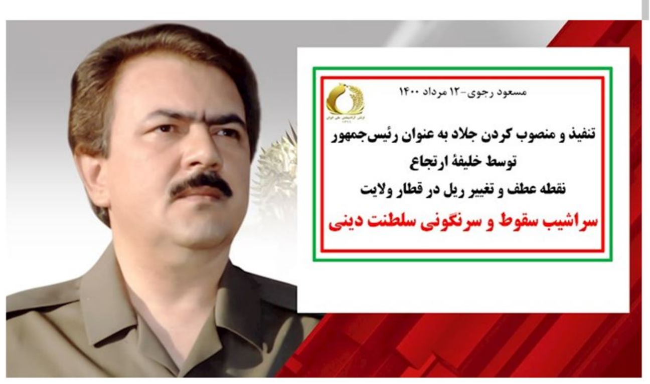
Figure 4: Image of Massoud Rajavi in a Word document used as decoy content alongside CHIMNEYSWEEP in August 2021