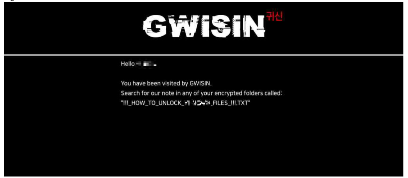
Figure 5. Desktop after being infected

The Gwisin cases show that the anti-malware products are neutralized before the infection process begins. As V3 products block Gwisin ransomware using such a method in the injection process through behavior-based detection, it is necessary to enable the 'Behavior-based Detection' option.