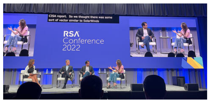
Zero Trust | June 14, 2022

How to build trust in a zero-trust environment: Security leaders share insights