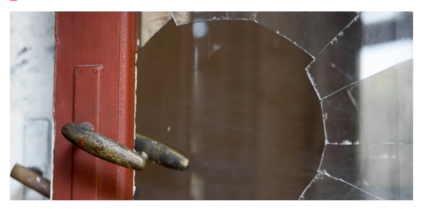
ransomware | June 28, 2022

blog.reversinglabs.com/blog/smash-and-grab-astralocker-2-pushes-ransomware-direct-from-office-docs