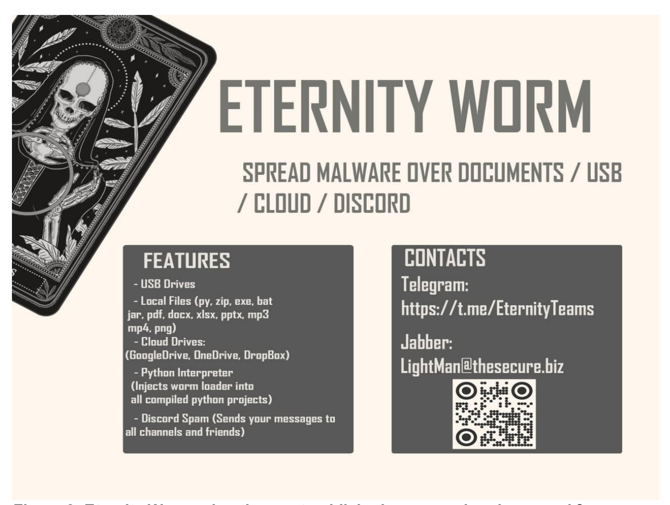
Figure 3. Eternity Worm advertisement published on several underground forums

The Eternity Worm is able to spread itself over documents, USB, Cloud, and Discord. The price for Eternity Worm is $300 and the source price is $1200.