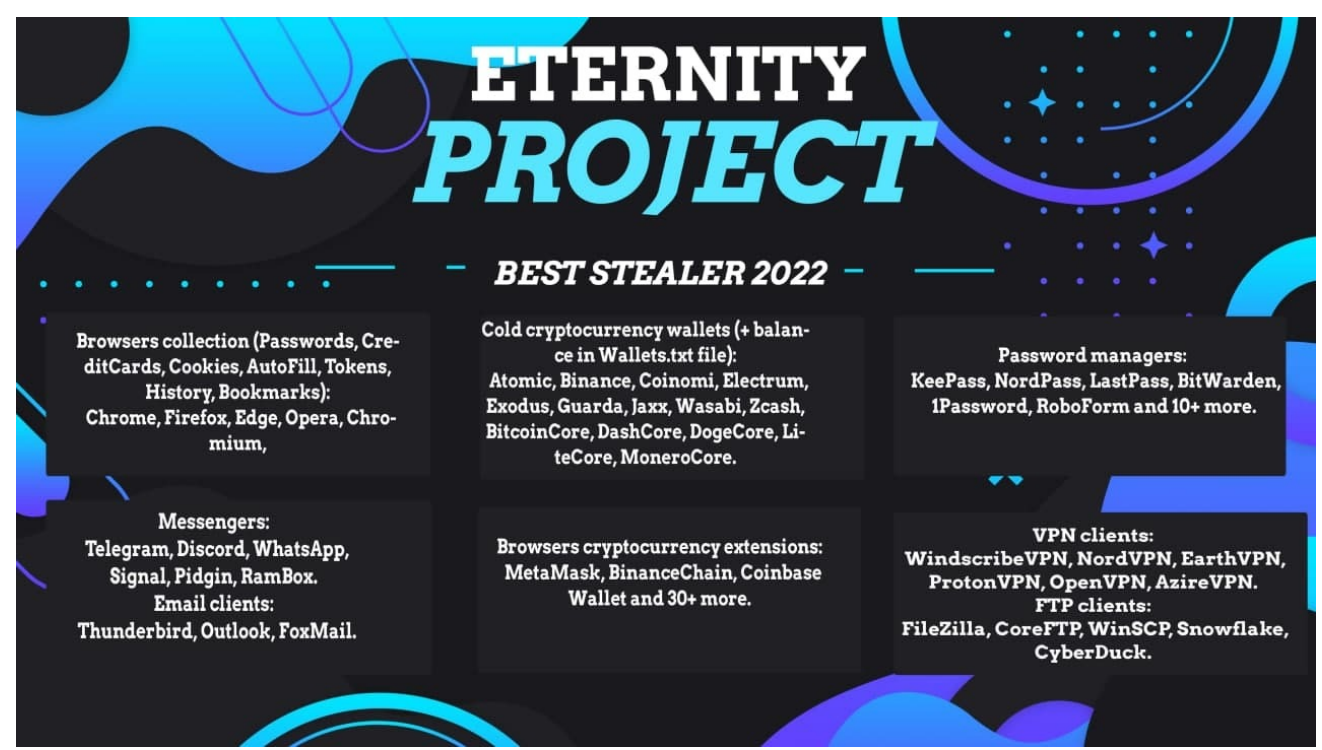
Figure 2. Eternity Stealer advertisement published on several underground forums

The Eternity information stealer, advertised as the Eternity Stealer or Eternity Project , is the one that interests the most on forums. More details on this malware are given in the following part.