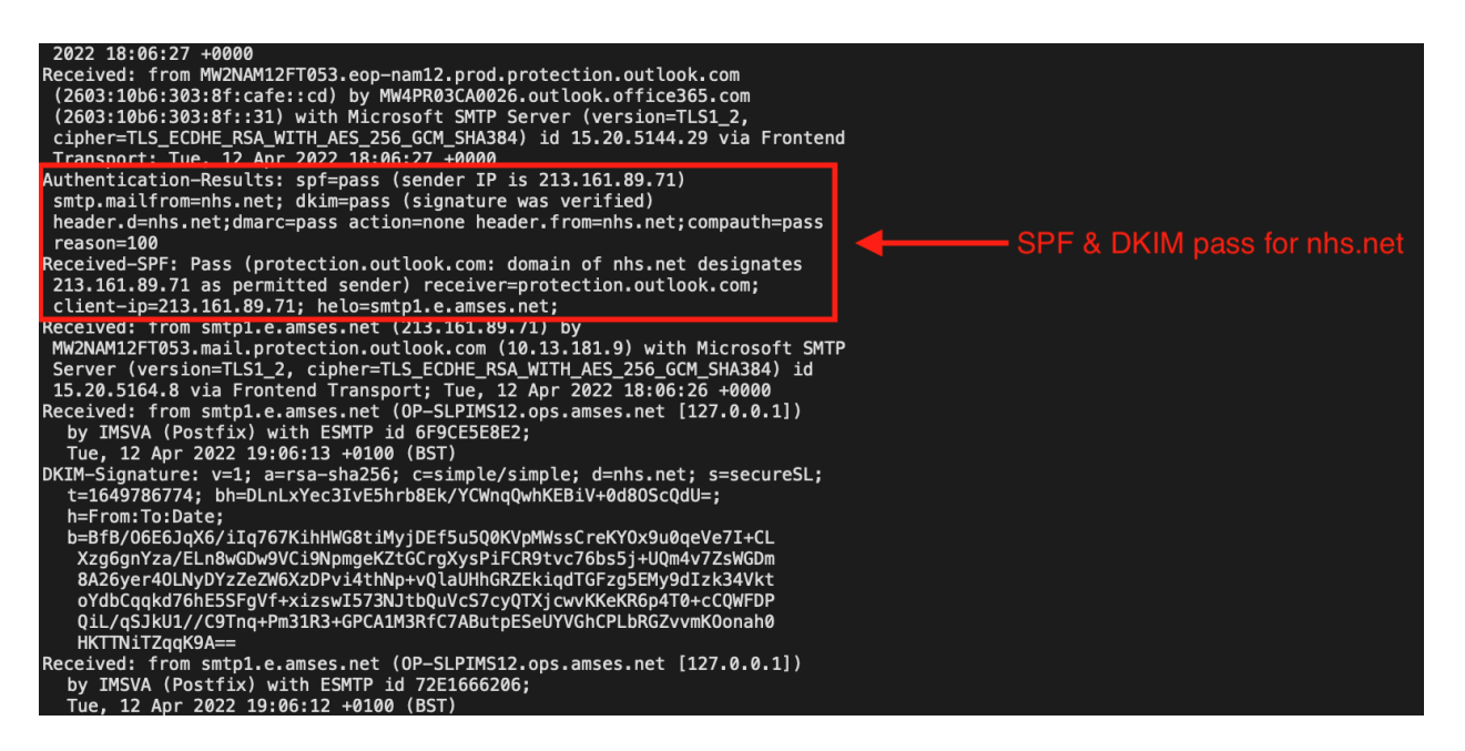
All phishing emails authenticated to nhs.net

The majority were fake new document notifications with malicious links to credential harvesting sites that targeted Microsoft credentials. All emails also had the NHS email footer at the bottom.