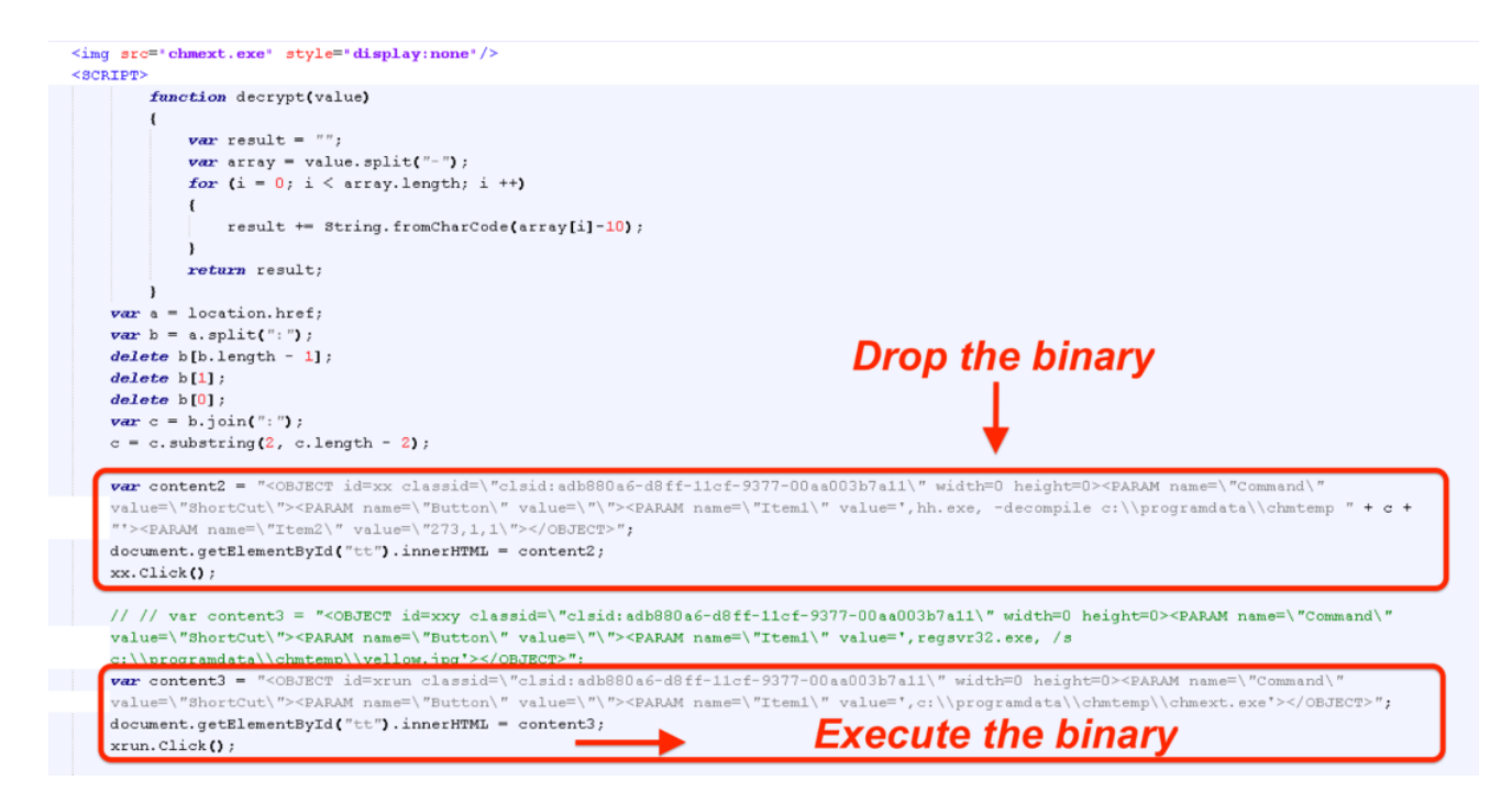
Figure 6: HTML code dropping and executing the binary

The code responsible for extracting, dropping and executing the binary is present inside 1hh.html as shown below.