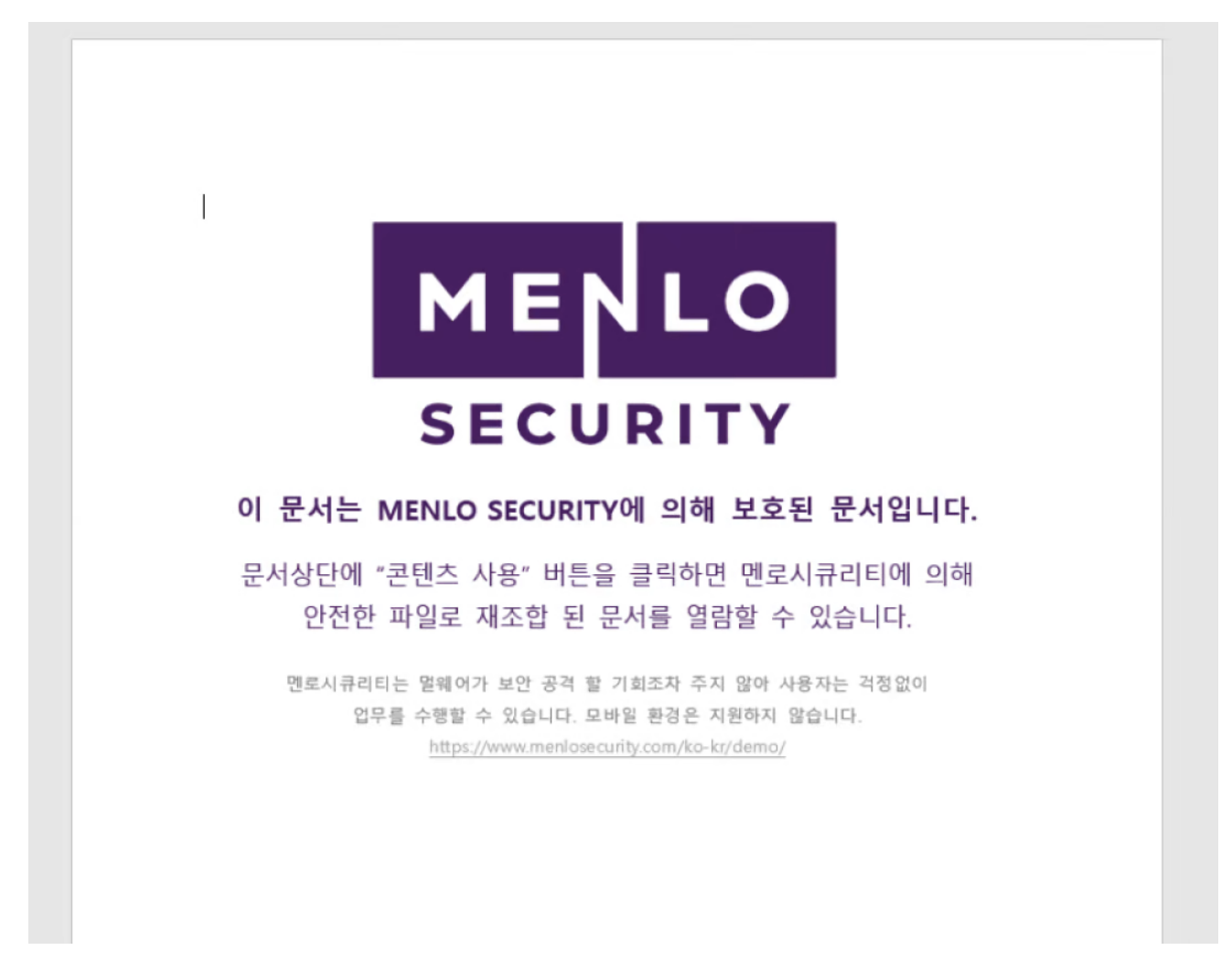
Figure 3: Decoy content

Figure 3 below shows that the decoy content of the document is related to Menlo Security company. This is consistent with other decoy contents used by the threat actor. For instance, in the document with MD5 hash: 1a536709554860fcc2c147374556205d, the decoy content used was related to Ahnlab - a Korea-based computer security company. This is done for the purpose of social engineering.