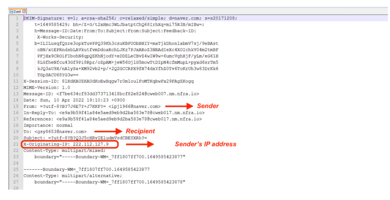
Figure 5: Email header showing originating IP, Sender and Recipient

Figure 5 below shows the sender's IP address in the email headers as indicated by the X-Originating-IP field.