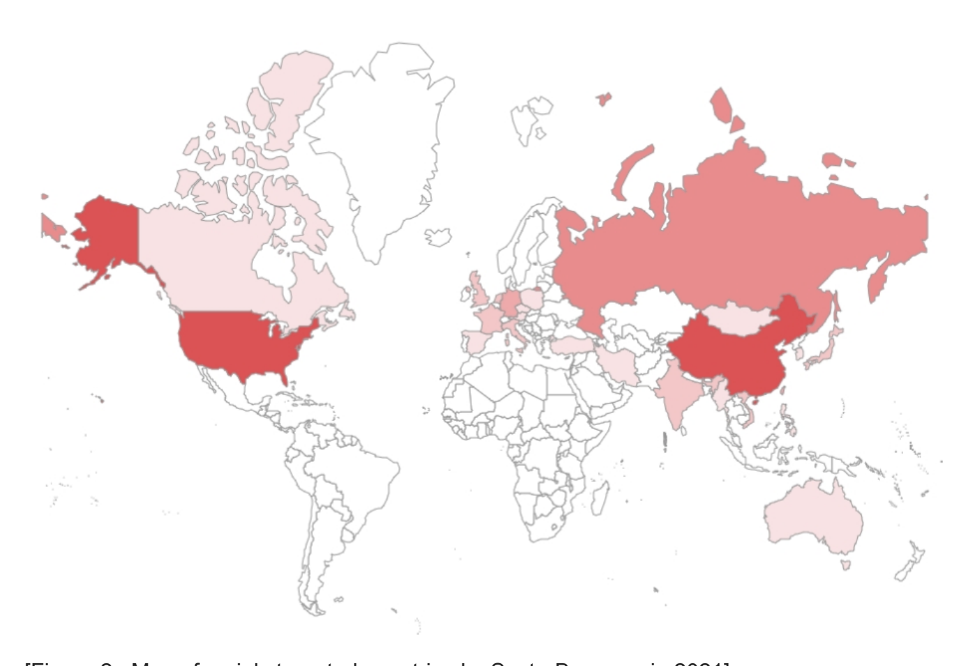
[Figure 2 : Map of mainly targeted countries by SectorB groups in 2021]

The following figure is the map of targeted countries of SectorB groups in 2021. A darker shade of red represents a higher number of attacks.