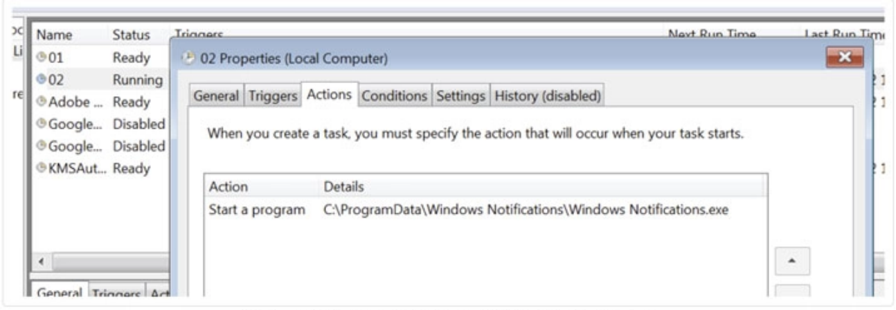
Two scheduled tasks created by Barb(ie) downloader for persistence