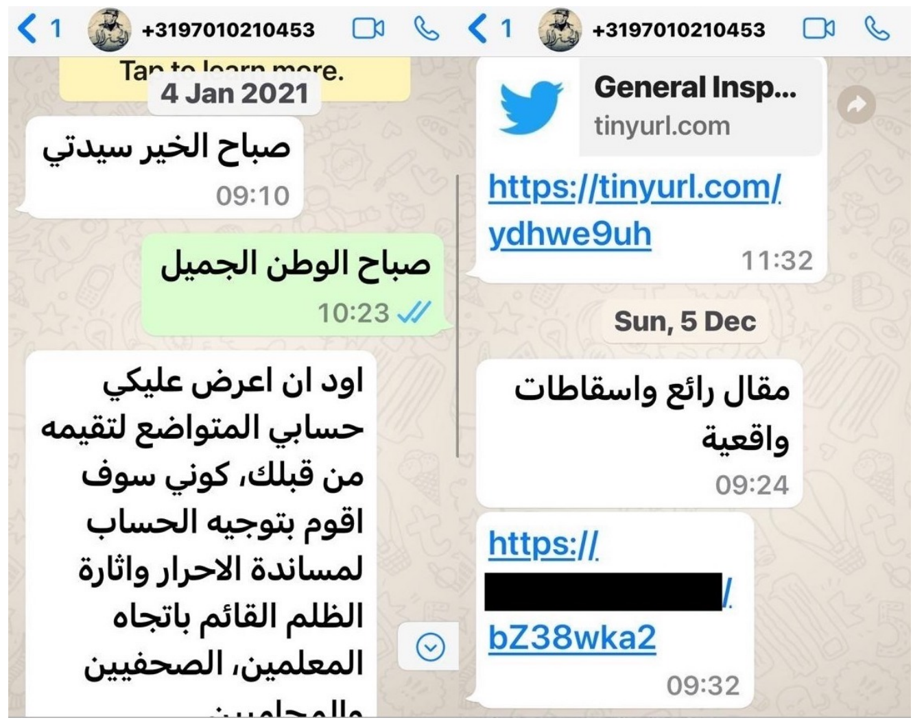
Figure 6: WhatsApp messages containing Pegasus links sent to Suhair Jaradat. We redact the December 2021 domain name.

We translate the messages sent to Jaradat below: