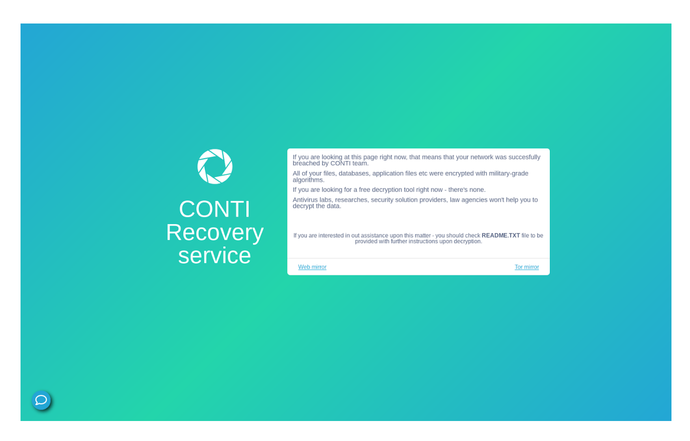
Figure 4. Updated Conti ransom portal landing page