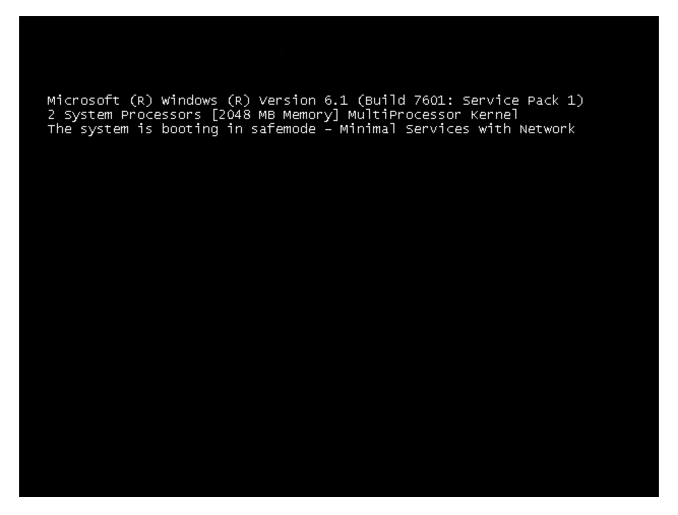
Figure 2. Conti booting Windows into Safe Mode with networking enabled to encrypt files

Conti then executes the command bcedit.exe / set { current } safeboot network and forces a system reboot by calling the Windows API function ExitWindowsEx() . This will launch Windows in Safe Mode with networking enabled as shown in Figure 2. The network mode is enabled, so that Conti can still be used to encrypt files on network shares.