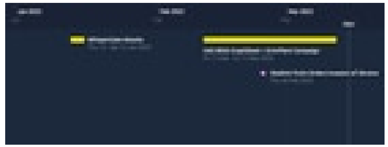
Timeline Demonstrating Known UAC-0056 Activity