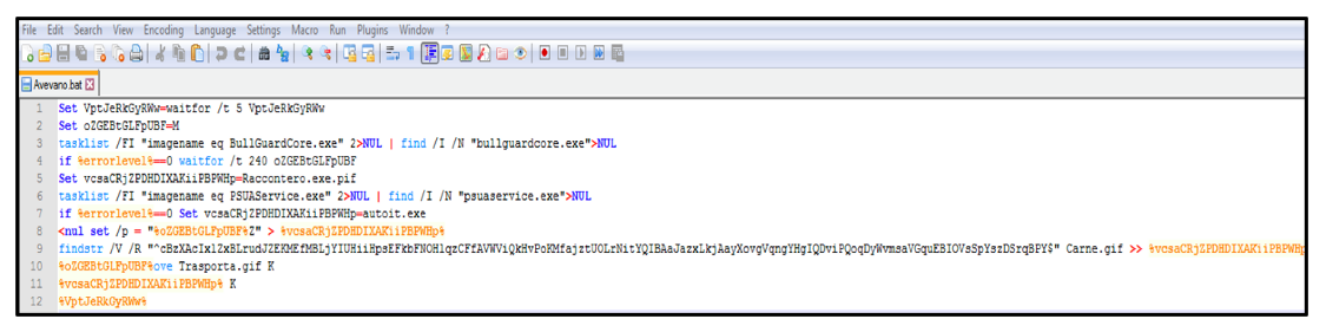
Figure 4 - Malicious BAT Script "Avevano.gif"

The structure and contents of the BAT script, such as obfuscated variables, can be seen in Figure 4 below. The script performs a scan against a task list referencing two antivirus (AV) products, "BullGuardCore" and "Panda Cloud Antivirus." If the AV products are present, the malware will perform a "sleep" function to delay execution and aid in bypassing detection.