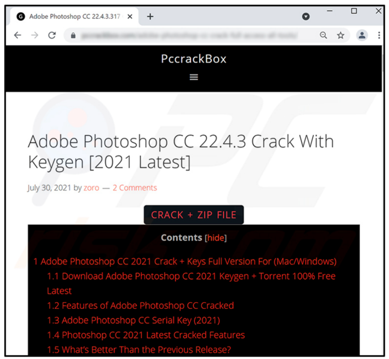
Figure 1 - Example of malicious webpage offering cracked software

Once the victim downloads what they assume is cracked software, an SFX file called "7ZSfxMod_x86.exe" is dropped to their machine, as shown in Figure 2.