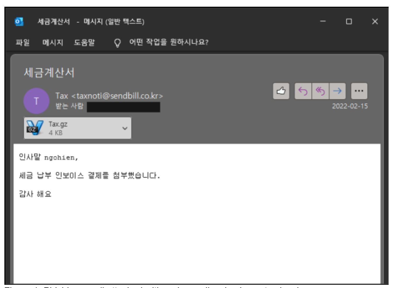
Figure 1. Phishing email attached with malware disguised as a tax invoice