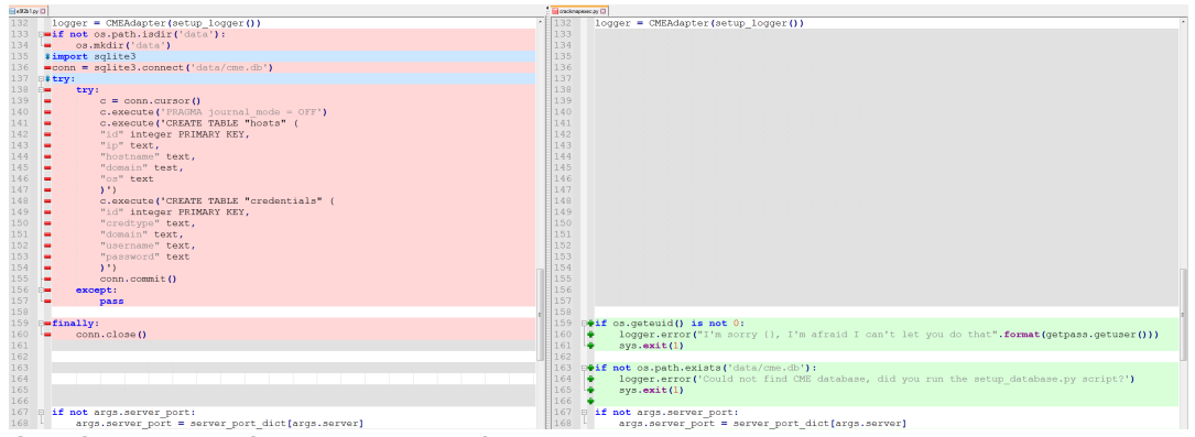
Figure 6: Modified

Mandiant observed UNC3313 leverage publicly available offensive security tools to accomplish remote command execution, internal reconnaissance, network tunneling, and lateral movement. UNC3313 used a slightly modified version of the open-source pen-testing tool CrackMapExec v3.0 (CRACKMAPEXEC) compiled with Pyinstaller to perform system enumeration and user account reconnaissance and to execute remote commands on target systems. The modified version of CRACKMAPEXEC used by the attacker, named aa.exe, had the tool's description removed and included the database setup code from the utility setup_database.py to bypass extra installation steps (Figure 6).