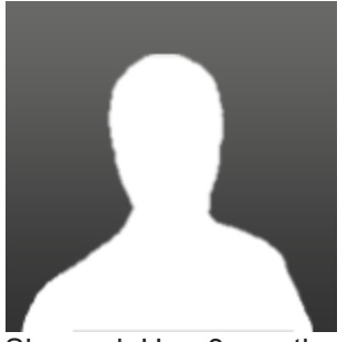
Skyward_Ho - 3 months ago