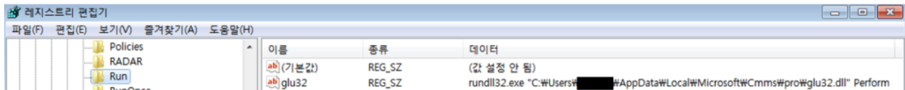
Figure 1. Path for registry registration and self-copy

The installer first executes Gold Dragon by giving the “Start” argument. Once the “Start” export function is executed, Gold Dragon copies itself to a certain path and registers the copied DLL to the autorun registry key. The “Perform” export function is given for DLL execution argument.