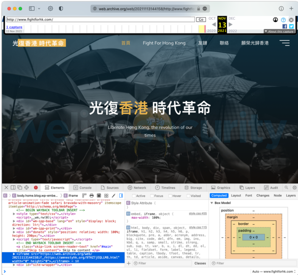
Figure 1. fightforhk[.]com , as archived by the Wayback Machine on November 13th

ESET researchers found another website, this time legitimate but compromised, that also distributed the same exploit during the few months prior to the Google TAG publication: the online, Hong Kong, pro-democracy radio station D100 . As seen in Figure 2, an iframe was injected into pages served by bc.d100[.]net – the section of the website used by subscribers – between September 30 th and November 4 th 2021.