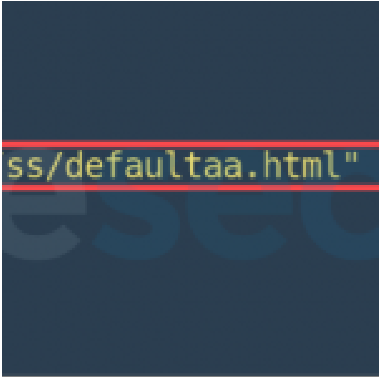
Figure 2. Excerpt of https://bc.d100[.]net/Product/Subscription on November 4th 2021