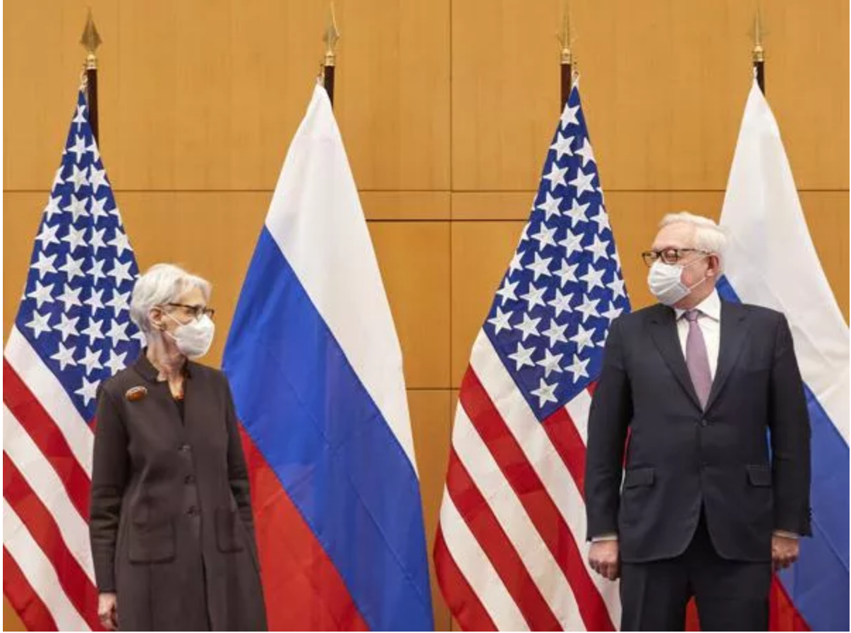
(The United States and Russia meet for highest level security talks on January 10, 2022, in Geneva)

The timing of this arrest is coincidental with the recent US-Russia security talks and can be directly related to the political discussions within the geopolitical relationships between the countries.