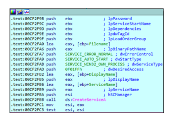
Figure 2 - Service Creation

In its first execution by setup.exe, winpickr.exe (with the "update" argument) creates a new service named "PickerSrv" (Display name: FilePicker UI Server) whose purpose is to execute itself at startup and stay persistent on the endpoint.