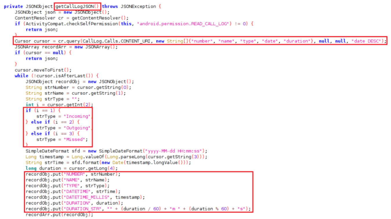
Figure 6 – Code to Read Call Logs

The code snippets in Figure 6 show that the application steals the device's call logs data.