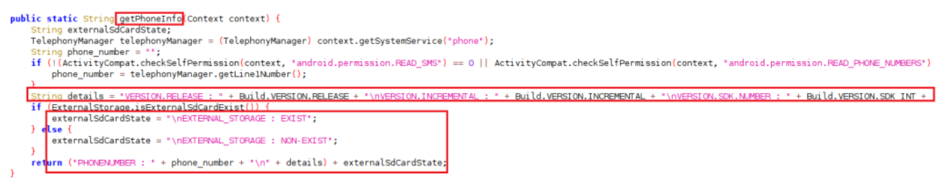
Figure 7 – Code to Read Device Information

The code snippets shown in Figure 8 show that the application steals the account details being used on the device.