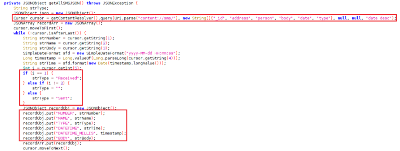
Figure 5 – Code to Read SMS Data

The code snippets in Figure 6 show that the application steals the device's call logs data.