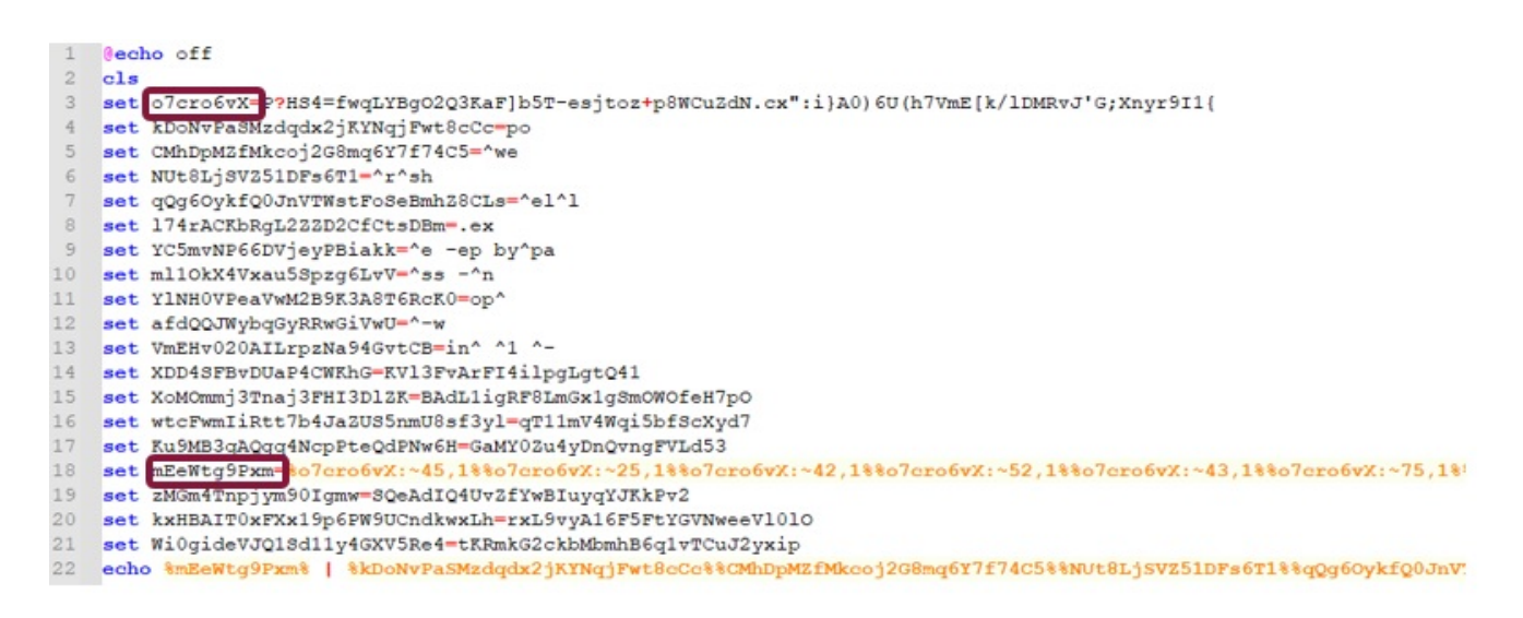
Figure 6 - Layer 2 of obfuscation

These lines define the substitution and we can use them to deobfuscate the first layer. After deobfuscating the first layer, we get another layer of obfuscation: