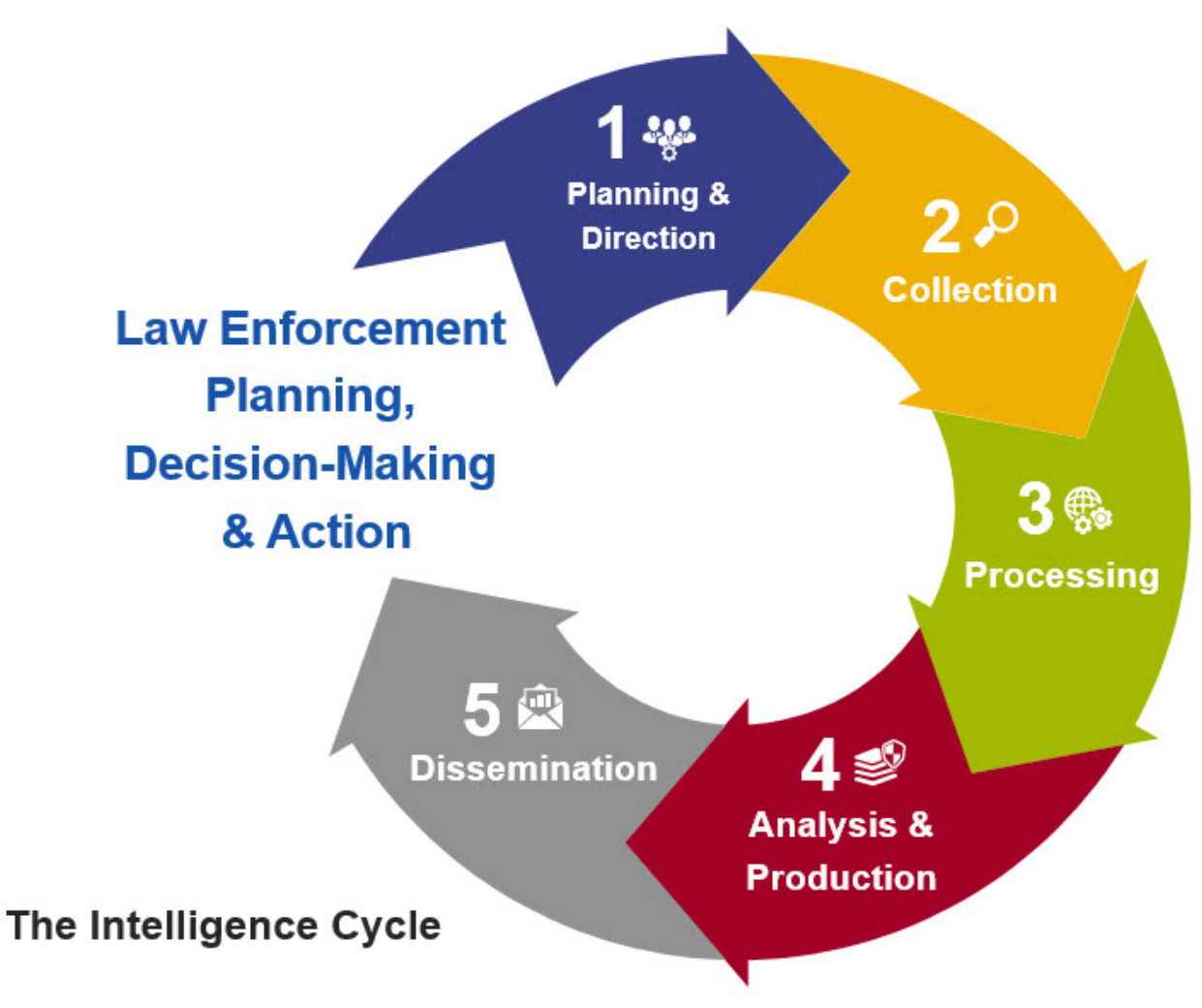
Figure 1 — The intelligence cycle is the process of developing raw information into finished intelligence for consumers, including policymakers, law enforcement executives, investigators, and patrol officers.

Creating completed intelligence that serves a useful purpose requires well-defined intelligence requirements. The end output then informs decision makers on relevant topics. This is what threat hunting should aim to do — find threats of concern and provide data that informs decisions.