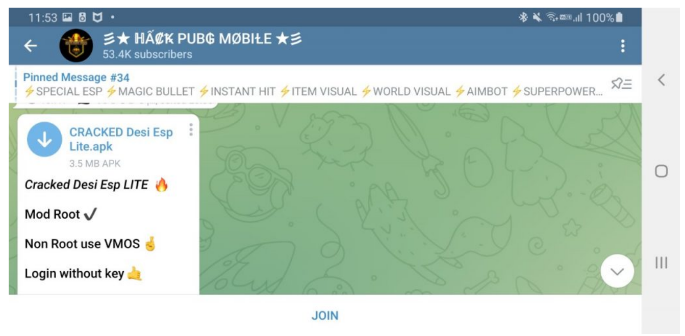
Figure 1. Re-packaged hacking tool distributed in Telegram