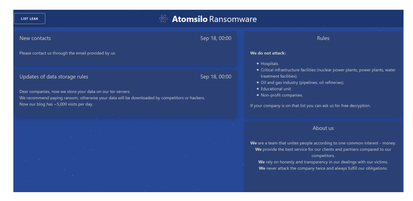
Figure 1: AtomSilo leak site.

The malware is relatively short and simple to analyze, so it's definitely a beginner-friendly choice for those who want to get into ransomware analysis!