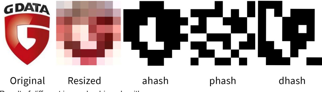
Image hashing algorithms are also used in sample clustering and applied to an image visualization of the malware file itself [bhaskara18].

Result of different image hashing algorithms