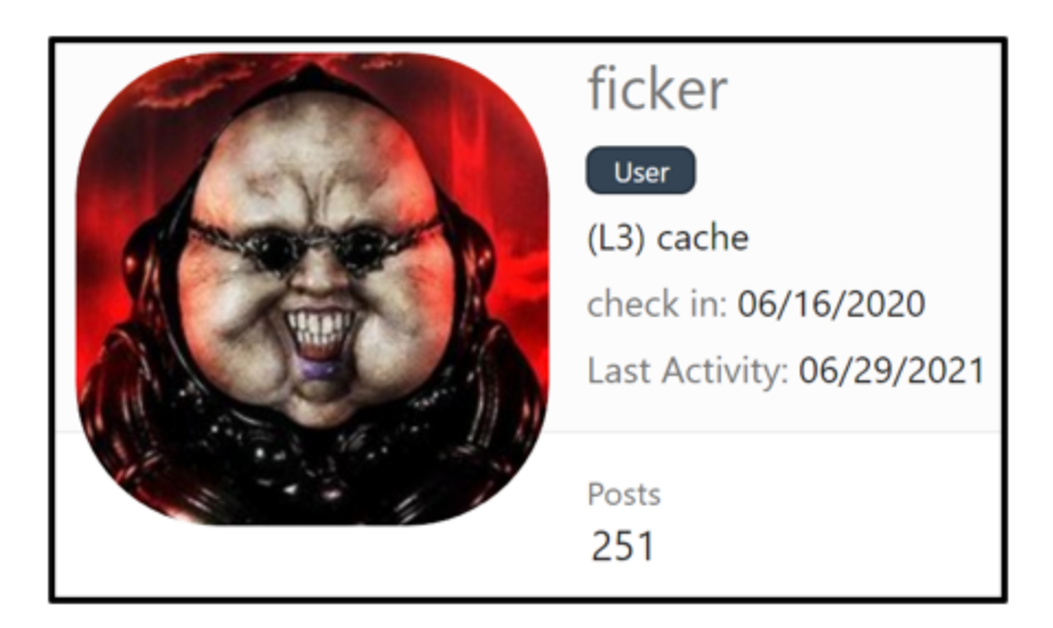
Figure 1: Ficker is named after its creator/promoter

Ficker offers several paid packages, with different levels of subscription fees to use their malicious program. Once the malware subscription is purchased, the malware author provides a web-based panel to the buyer to collect and examine information stolen from victims, as well as the executable of the information stealer itself.