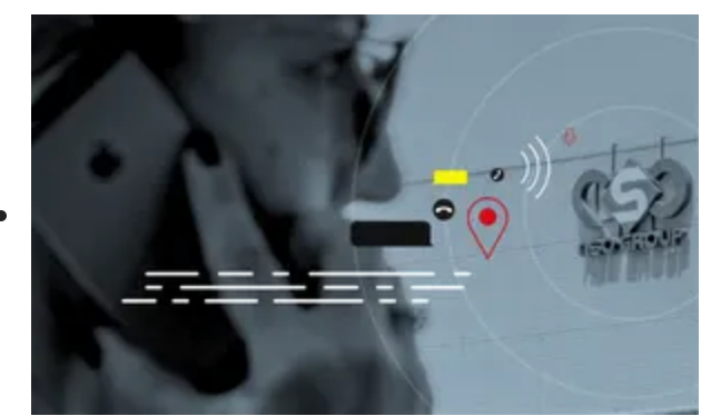
What is Pegasus spyware? And how does it hack phones?

NSO Group software can record your calls, copy your messages and secretly film you