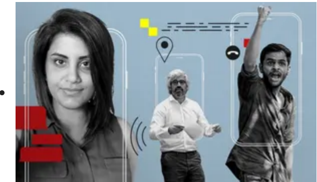
The Pegasus project Why investigations like this are at the heart of the Guardian's mission

The spyware technology that threatens democracy