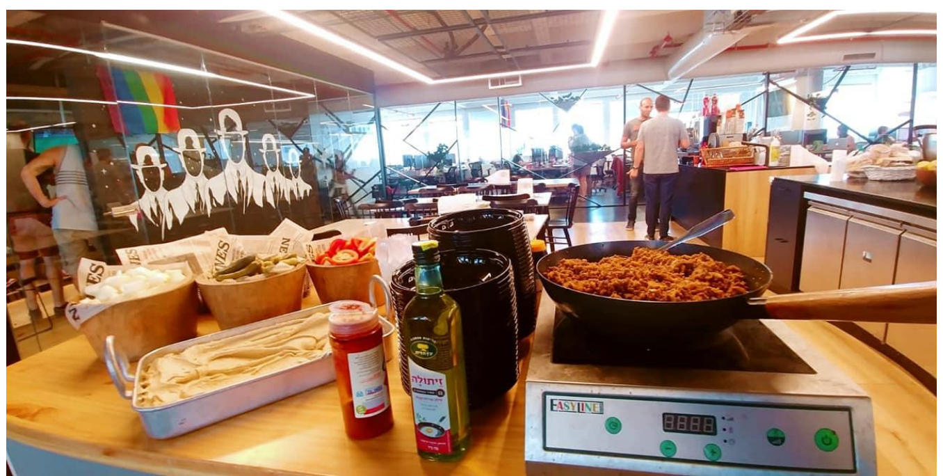
Figure 1: A distinctive mural of five men with empty heads wearing suits and bowler hats is displayed in this "Happy Hour" photo a previous Candiru office posted on Facebook by a catering company.<sup>1</sup>

The company known as "Candiru," based in Tel Aviv, Israel, is a mercenary spyware firm that markets "untraceable" spyware to government customers. Their product offering includes solutions for spying on computers, mobile devices, and cloud accounts.