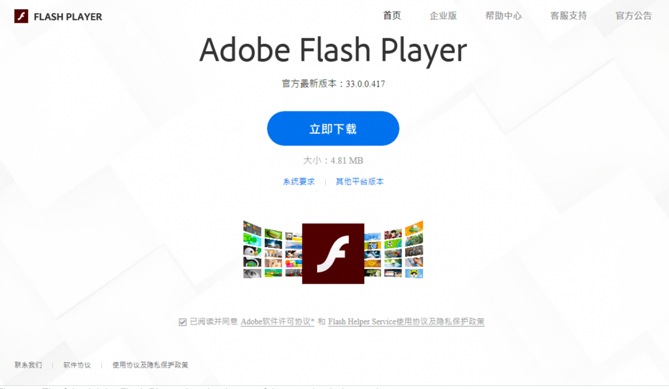
Figure 4. The fake Adobe Flash Player download page of the watering hole attack