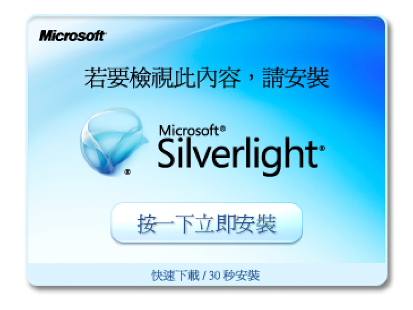
Figure 5. The fake Silverlight download page of the watering hole attack