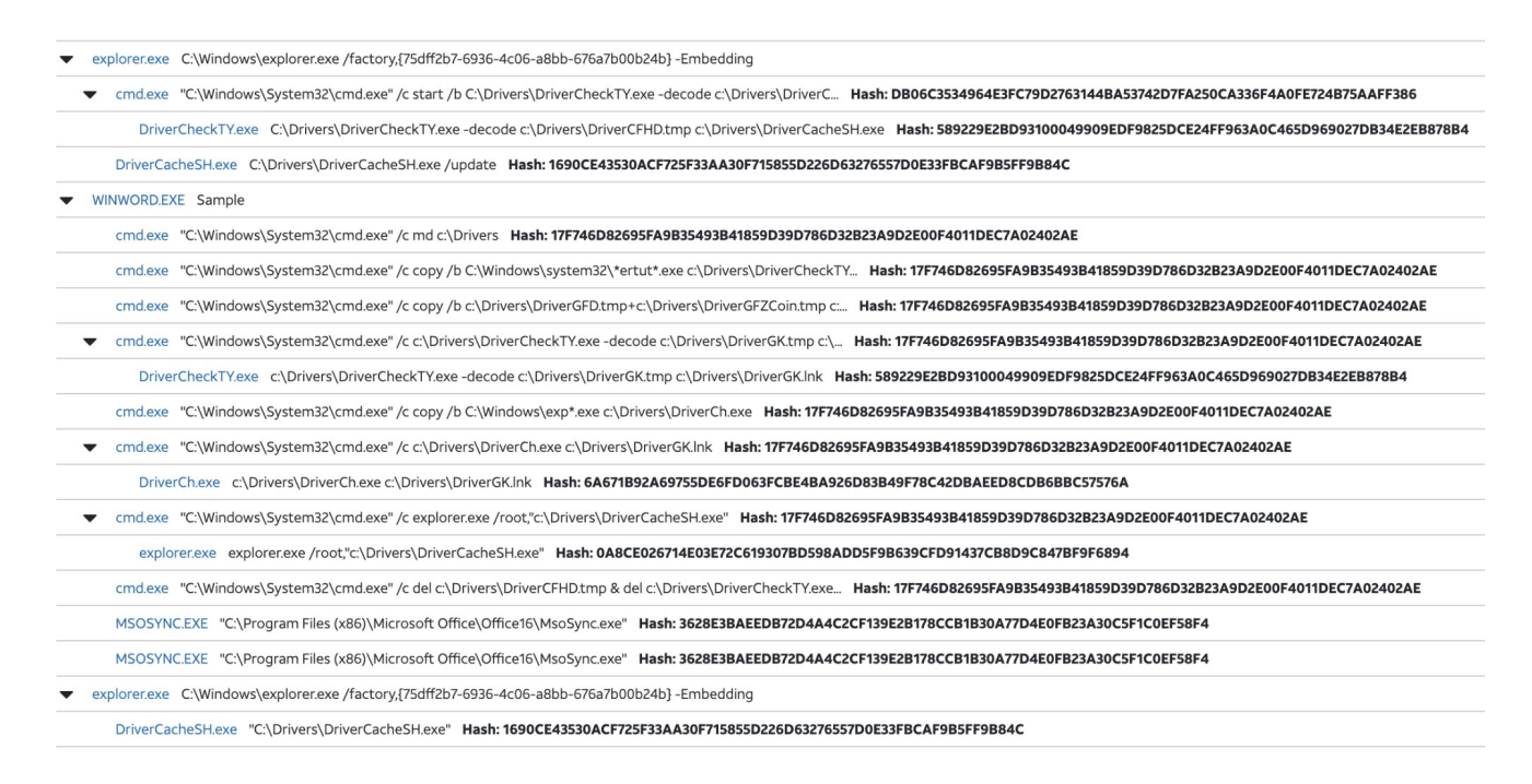
Figure 7: Malicious Document execution tree, as captured by AT&T Alien Labs.

the Macro will proceed to send the beacon to the C&C with the execution status and delete all the temporary files, attempting to clean their tracks. The only files left in C:\Drivers\ at this point are the payload and the .inf file.