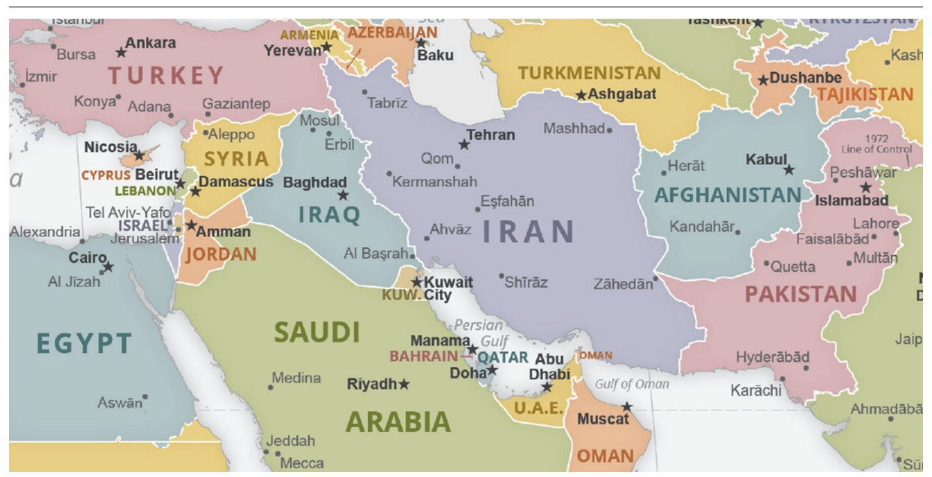
Figure 1:Middle East