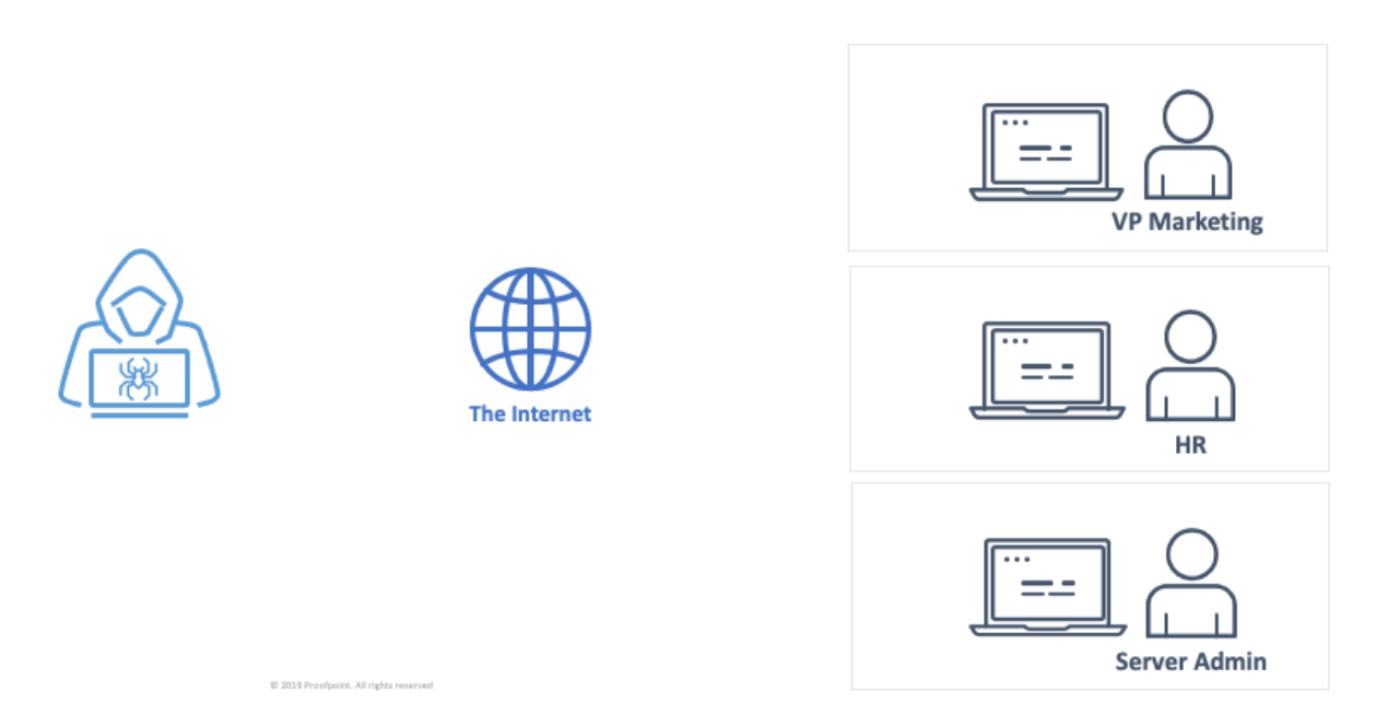
Figure 3: Sample attack chain via initial access broker