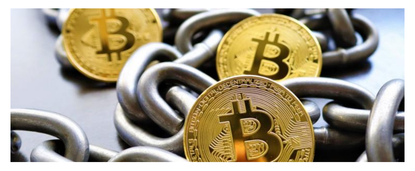
June 10, 2021 Axel F