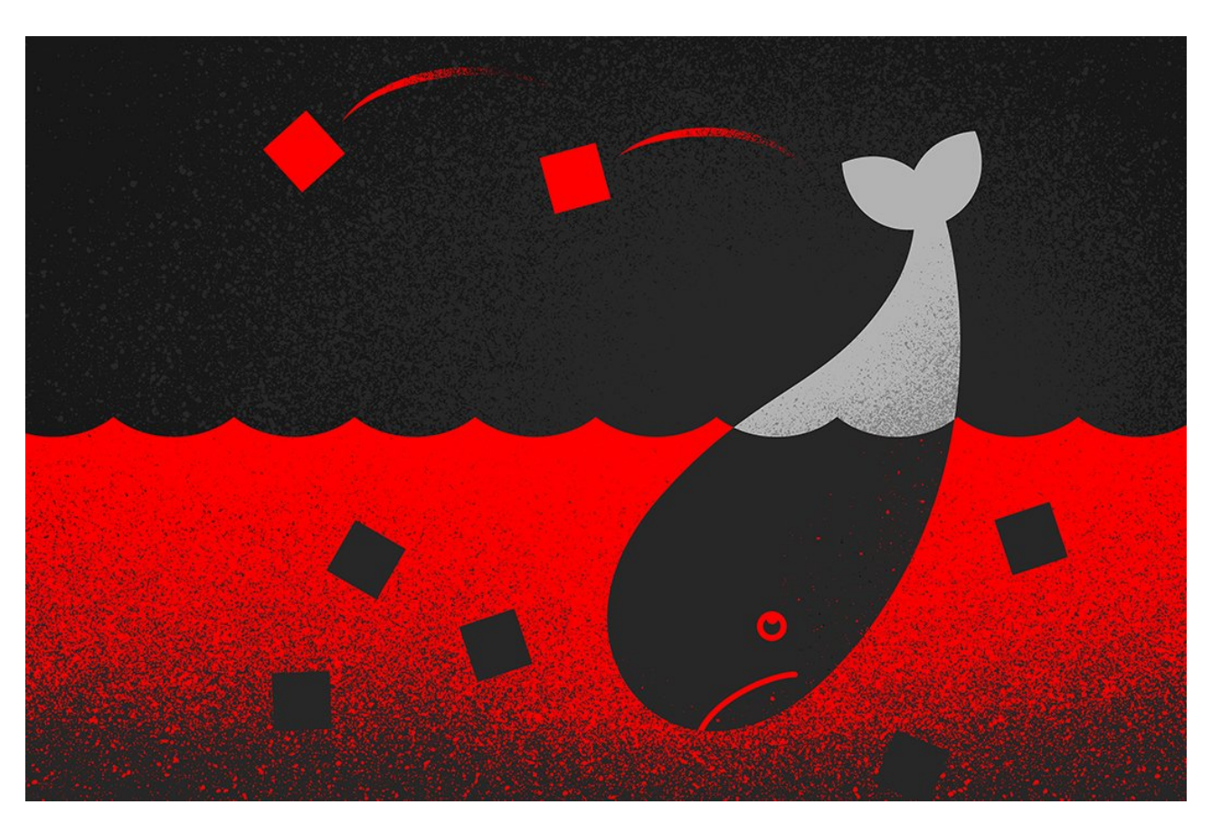
Compromised Docker Honeypots Used for Pro-Ukrainian DoS Attack