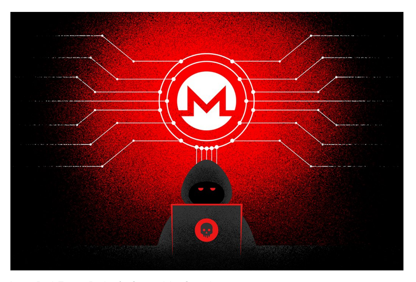
<u>LemonDuck Targets Docker for Cryptomining Operations</u>