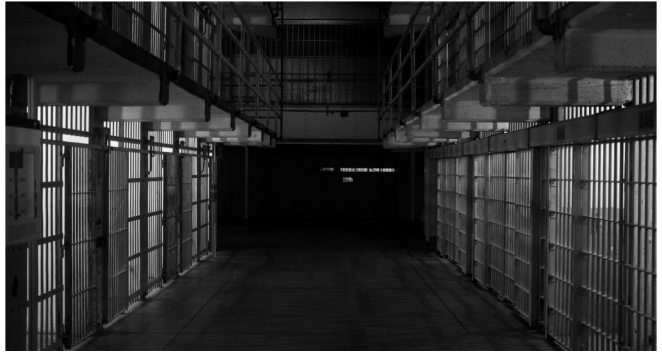
Two members of the <u>Carbanak (Cobalt) cybercrime group</u> were sentenced today in a Kazakhstan court to eight years in prison for stealing from Kazakhstan banks.

The sentencing was <u>announced</u> today by the Almaty city prosecutor's office.