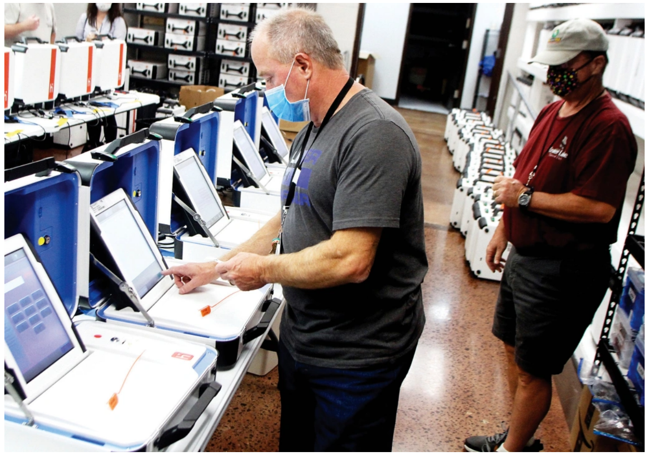
How officials are protecting the election from ransomware hackers

Concerns about an attack on election systems are real. But a hack wouldn't damage the vote as much as the disinformation that would result.