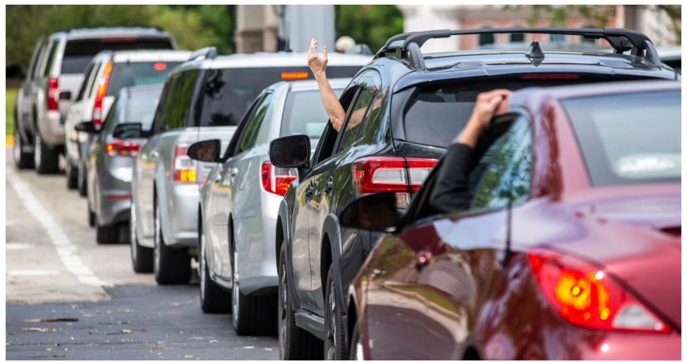
Could the ransomware crisis force action against Russia?

Moscow's blind eye toward cybercriminals has made escalating attacks inevitable, say experts. But changing the approach is easier said than done.