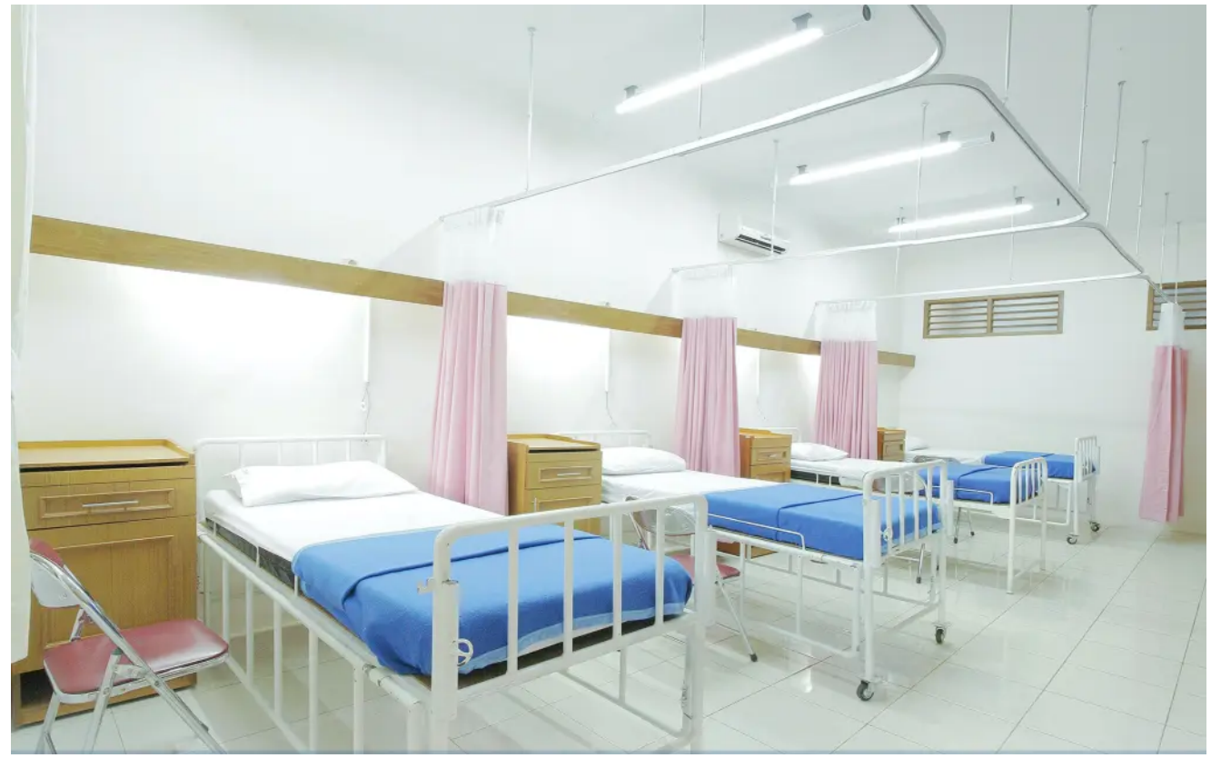
A wave of ransomware hits US hospitals as coronavirus spikes

An unprecedented and opportunistic attack raises a disturbing question: Will it cost a life?