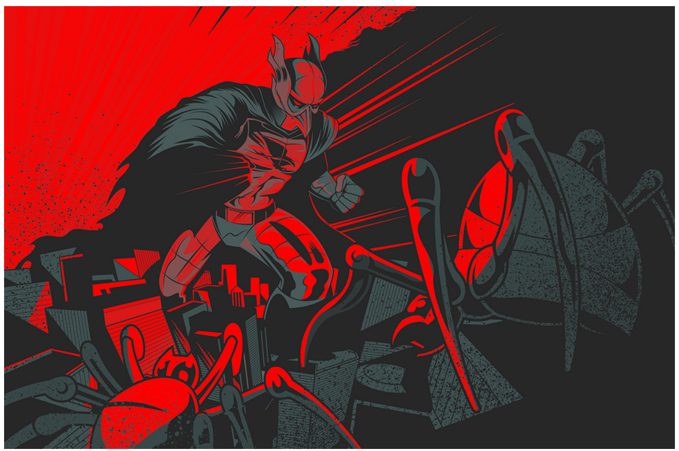
This Falcon Complete incident response investigation recap was originally published by <u>IT-daily.net on Apr. 13, 2021</u>.

It was late on a Saturday afternoon, and the Southern Hemisphere CrowdStrike Falcon Complete<sup>™</sup> team was getting ready to clock off and hand over to our Northern Hemisphere colleagues; things were seemingly quiet and under control. After a long week, we were ready to kick back and enjoy the weekend. However, within seconds, thousands and thousands of high-severity detections started to roll in for one customer, filling the queues with a proverbial flood.